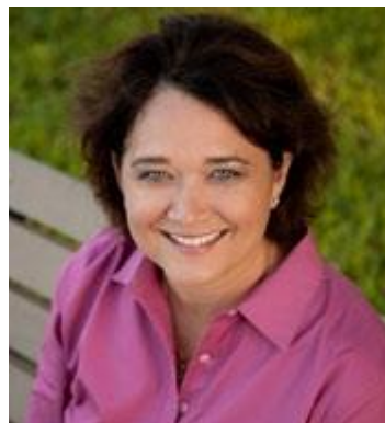
Commissioner Heather Gracy